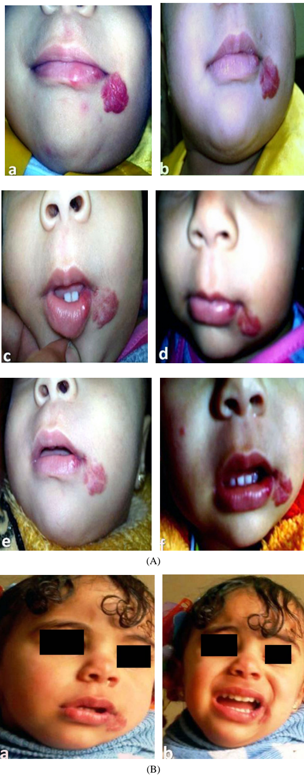
Figure 3. (A) hemangioma of the perioral area of a girl aged 4 months and weighed 7 kg. (a) at admission; (b) after one month; (c) after two months; (d) after three months; (e) after four months; (f) after five months; (B) Hemangioma of the perioral area after two years. (a) at rest; (b) during crying.