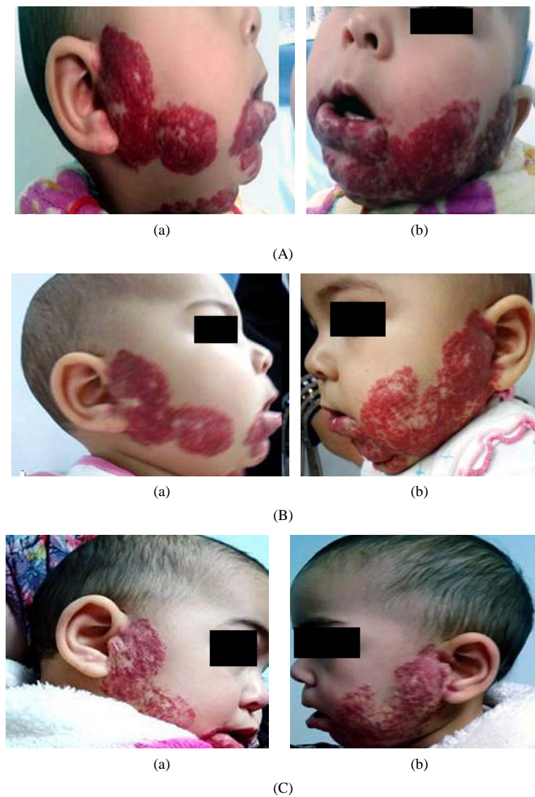
Figure 5. Facial hemangioma of a girl aged 6 months and weighed 8.5 kg treated with corticosteroids. (A) At admission, (a) right side, (b) left side; (B) After one month, (a) right side, (b) left side; (C) After eight months, (a) right side, (b) left side.

mangioma. However, propranolol is well tolerated and is known to have safety in children. In addition, propranolol can be used in non-responsive cases to corticosteroids. Moreover, the side effects of systemic corticosteroids are relatively common. Growth retardation is more common if treatment is started before 3 months of age or continued for 6 months or longer [22].