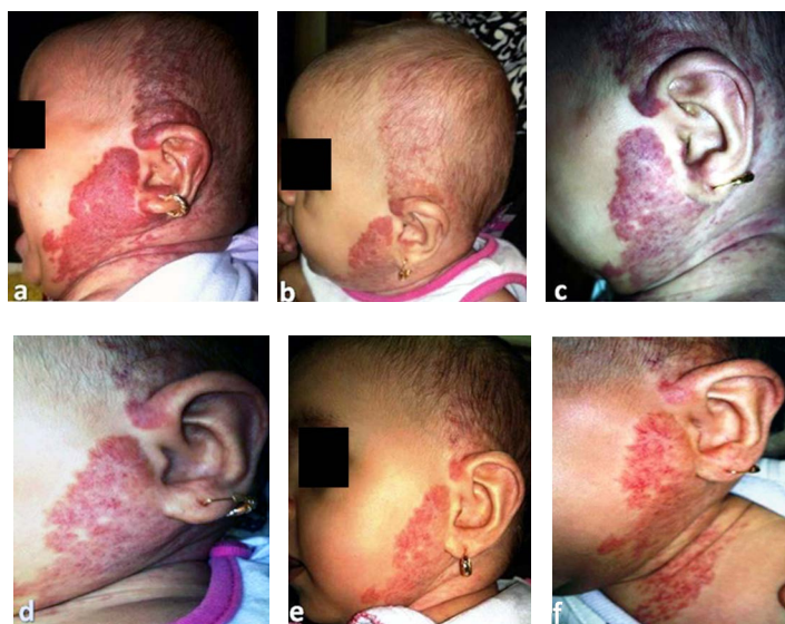
Figure 1. Facial hemangioma of a girl aged 3 months and weighed 6 kg. (a) At admission; (b) after one month; (c) after two months; (d) after three months; (e) after four months; (f) after five months.

Patients' demographic data and lesions' data are collectively summarized ( Table 3 ). In total, 15 children were treated with propranolol orally ( Figures 1-4 ). The treatment lasted for a period of 3 to 4 months without major complications. After one week from reaching the target dose (3 mg/kg) a change in color was observed in 100%