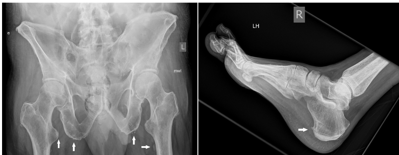
Figure 2. X-rays from Patient 2 (hip left panel; ankle and foot right panel). Films show enthesopathy involving multiple pelvic regions as well as the right heel. White arrows indicate ligamentous ossification characteristic of enthesopathy. Bone eburnation was also noted.