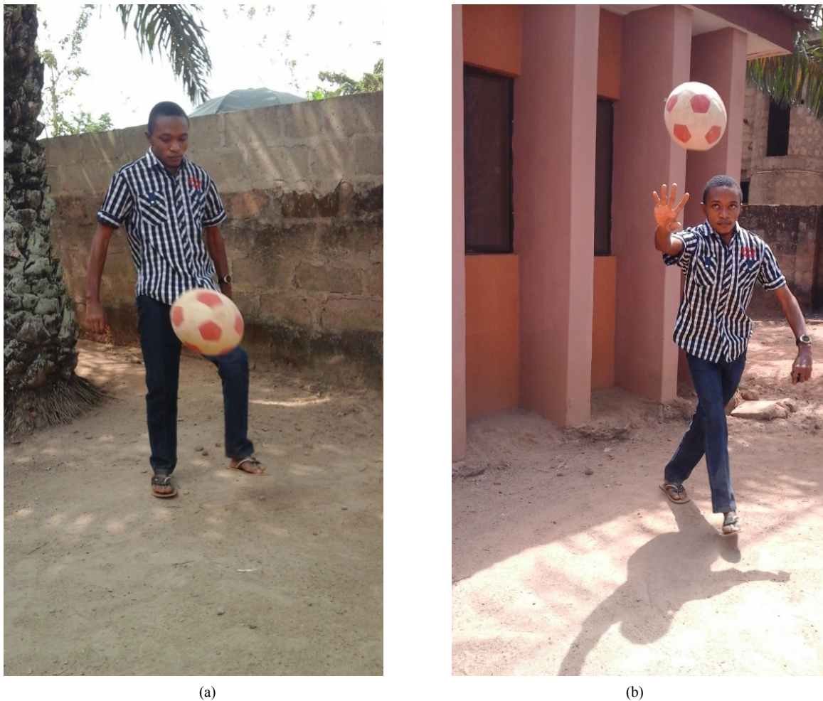
Figure 8. Patient playing a football.

neurologic recovery is feasible in spinal quadriplegia that fails to respond to antituberculous therapy when adequate decompression and fusion are done. Since tuberculous spondylitis is common in Nigeria, effort should always be made towards adequate treatment, aiming for an outcome as rewarding as our patient's.