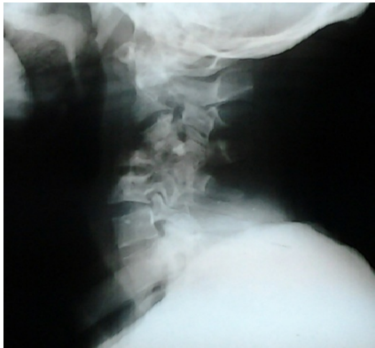
Figure 1. Plain cervical spine X-ray of the patient showing collapsed vertebral bodies of C3 to C5 with destruction of their intervening discs, and segmental kyphosis.

A working diagnosis of C4 quadriplegia secondary to an extradural cervical cord compression from Pott's