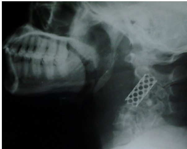
Figure 3. Plain cervical spine X-ray following the 2 nd stage.