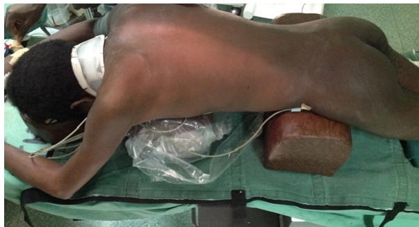
Figure 4. Patient positioned prone for posterior surgery.