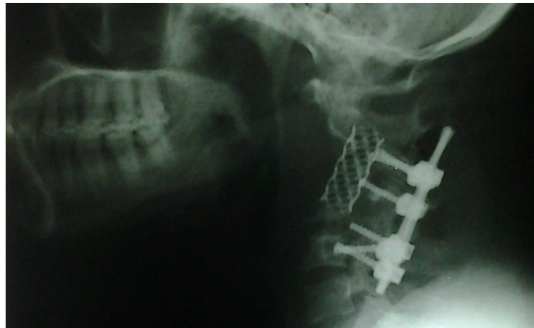
Figure 6. Plain cervical spine X-ray taken after the 3 rd stage.