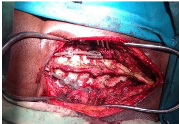
Figure 5. Intraoperative photo of the 3 rd stage.

tive lesions of the spine and paraspinous collections [9] [20]. Retropharyngeal collections are common in patients with cervical spine disease [3]. Other imaging findings include thecal sac compression and spinal deformities [21] [22].