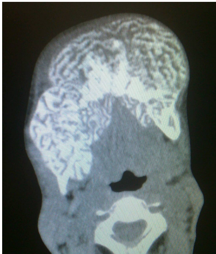
Figure 2. Axial CT of the face shows extensive bone growth with demineralization of the mandible with characteristic appearance of diffuse bone tunnels.