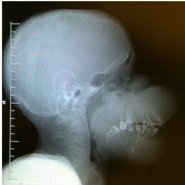
Figure 1. Lateral skull radiography reveals enlargement of both maxilla and mandible with ground glass appearance and loss of corticomedullary differentiation concomitant with dental malocclusion and absent Lamina Dura. Of note is narrowing of the oropharyngeal space.