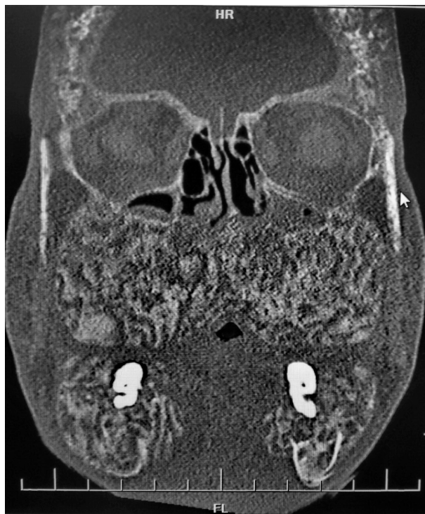
Figure 4. Coronal CT scan of face and skull: Hyperostosis of facial and cranial bones and ground-glass expansion of the maxilla, mandible and skull with bone tunnels are shown as consistent with uremic leontiasis ossea. Marked hypertrophy of the hard palate with significant narrowing of the oropharyngeal space are shown beautifully.