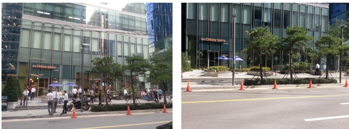
Figure 2. A POPS located in front of an office building with assembly facilities at the ground floor (left: weekday, right: weekend).

Other variables in favor of promoting the use of POPS were the existence of a metro station within 50 m from POPS. However, while AREA was a determinant for the user count in all four models, the coefficients for AREA were small and the rate of change of the user count with respect to alteration of AREA can hardly be substantial in terms of cost-efficiency. Moreover, according to the Building Act of Korea, the area of POPS is determined by the total floor area of the host building and the area of the building lot. The area of POPS is much