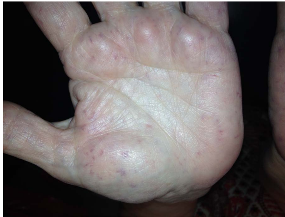
Figure 1. Telangiectasia of right palm.