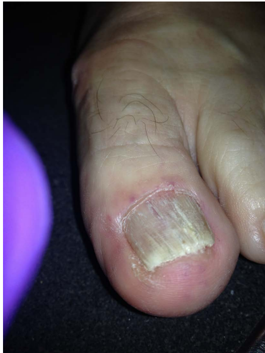
Figure 3. Telangiectasias of left great hallux.