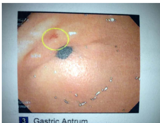
Figure 5. EGD showing gastric antrum AVM.

HHT affects various organs including the nose, skin, lung, brain, and gastrointestinal track. The most common and earliest clinical manifestation is epistaxis from telangiectasias in the nasal mucosa [3]. Over 90 percent of patients with HHT experience their first episode of epistaxis by the age of 21 [4]. Symptoms in the skin, lung, brain, and gastrointestinal track typically present later in the disease course. Common areas for telangiectasias to occur on the skin include the lips, tongue palate, fingers, face, or trunk [3]. Pulmonary arteriovenous malformations are the typical presentation of hereditary hemorrhagic telangiectasia in the respiratory tract. It is estimated that pulmonary arteriovenous malformations are seen in 5 to 15 percent of patients with hereditary hemorrhagic telangiectasia [5]. Neurological symptoms vary and include migraines, transient ischemic attacks, seizures, and hemorrhage [3]. Telangiectasias and hemorrhage are rare in the gastrointestinal track and typically are not symptomatic until the fifth or sixth decade if present. Liver involvement can also occur but is rarely seen [3]. Our patient presents with a late-onset variation of HHT. Epistaxis and other clinical manifestations did not appear until the sixth decade.