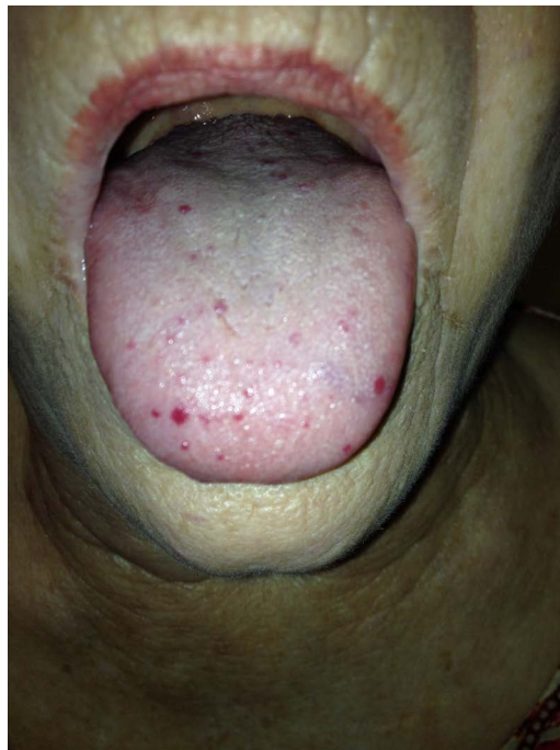
Figure 4. Telangiectasias of the tongue.

century as a hereditary disorder with abnormal vascular structures that caused recurrent bleeding from mucosa throughout the body [1]. Rendu first differentiated this disease from hemophilia when he studied a 52-year-old man with a clinical and family history of anemia, recurrent epistaxis, and telangiectasias. Osler and Weber produced more case reports on similar patients later on that made hereditary hemorrhagic telangiectasia well known within the medical community [2].