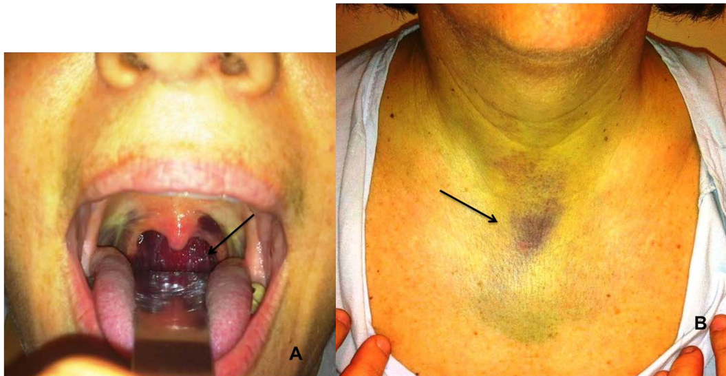
Figure 2. Clinical examination 48 h after admission. Bruises on the cervical and upper thoracic skin (A, arrow) and in the posterior pharyngeal wall (B, arrow) were suggestive of subcutaneous and submucosal hematomas.

range, 70% - 150%). Immunologically, the Bethesda test was positive for inhibitors of coagulation factor VIII (1.5 IU Bethesda).