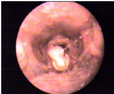
Figure 1. 70° video-endoscopy picture of larynx.

They were first described by Verocay in 1910 who called them neurinomas [1]. Schwannomas involve males and females equally and can occur at any age [1]. They usually involve the supraglottic larynx and may have an insidious clinical course. The most common nerve of origin for of laryngeal schwannoma is medial ramifica-