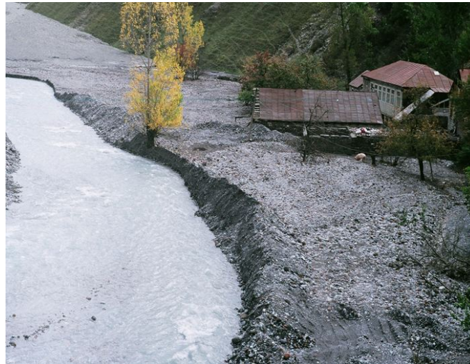
Figure 4. The situation in 2010 (September).