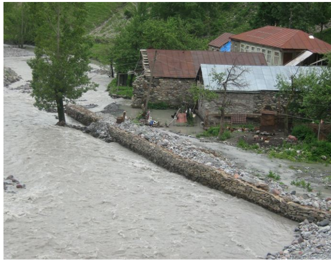
Figure 3. The situation in 2009 (June).