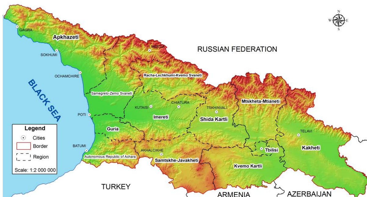
Figure 1. Map of Georgia.

The Alazani Artesian Basin takes its name from the Alazani River, which flows in the eastern part of the country in a northwest-southeast direction. It is the main tributary of the largest river of Georgia—the Kura.