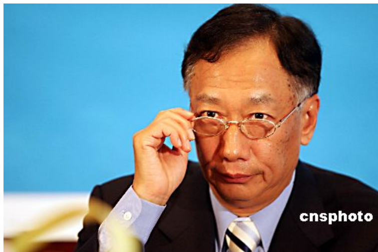
Figure 2. Guo of Taiwan’s Hon Hai Group would invest 1.8 billion US dollars in Shanxi, China.

Integrate the literature from Ness (1992), tsmc, CommonWealth, and SR values in four “pillars”, the valuables