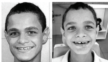
Figure 1. Facial aspect of twin siblings with the fragile X syndrome.

Genetic information might have health and reproductive implications for the patient and their family members. The responsibility for communicating this information within families generally lies with the patient or genetic counselor [20]. In this way, 13-year-old male ( Figure 1 )