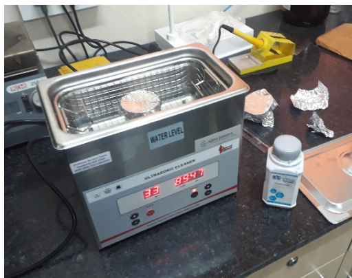
Figure 1. Sonification.

The graphite served as an anode once the potential of +10 V was set on it. Thus, the graphite itself played the role of anode while a platinum plate worked as the cathode, ground potential is set on it. The 1 M solution of water with \text{Na}_2\text{SO}_4 is used as electrolyte. After this all platinum electrodes and graphite foil residues are extracted and the suspension has salt, electrolyte residues, exfoliated graphene flakes, graphite residues are poured into a beaker and other chemical manipulations are subjected. Spectacular exfoliation of the foil is observed after only a few minutes, i.e. , loose black flakes split from the foil, forming a dark suspension while the foil electrode itself vanished gradually [33]. A direct current (DC) voltage is applied between the platinum and graphite electrodes, and the electrolysis procedure lasted 2 h for graphite powder and 30 min for graphite foil at room temperature. During this process, substances expected to work as a separator of newly exfoliated graphene flakes are added in one of two forms: a nano-powder of \text{CaCO}_3 (5 - 40 nm diameter) or a saturated solution of \text{Na}_2\text{CO}_3 [33] [34].