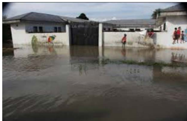
Plate 2. A school affected by flooding in Obololi community, Bayelsa state.