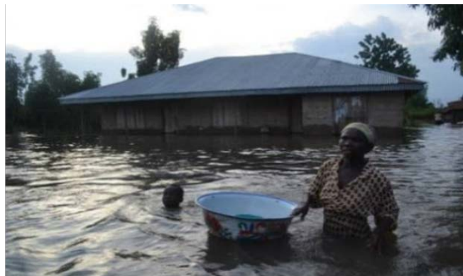
Plate 1. A Half-submerged residential building in the study area as a result of flood.

The findings of the study are presented below. Plates 1-4 show different scenarios of flooding in the study area.