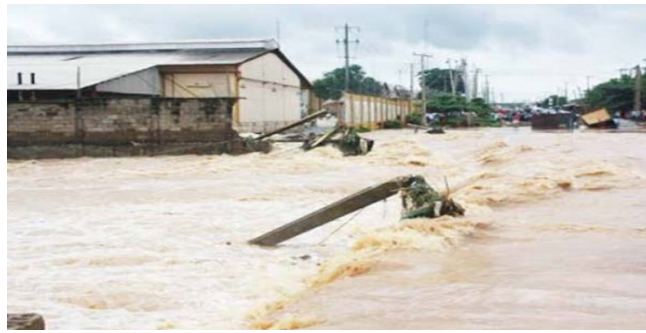
Plate 3. A flooded street in the study area.