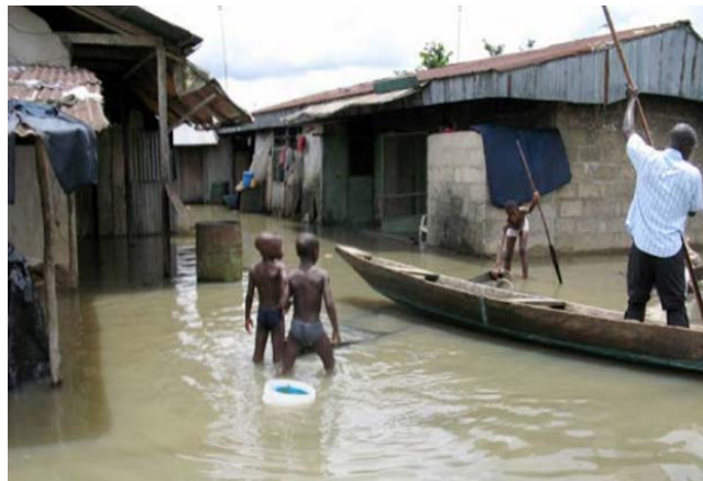
Plate 4. Azama community, Bayelsa state during flooding.