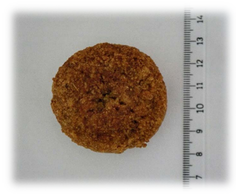
Figure 2. Falafel pie.

Falafel is a Jordanian popular food composed of chickpeas, parsley, onion, garlic, salt, and sodium bicarbonate and served after frying in palm or soybean oils for 3 min [6] [7].