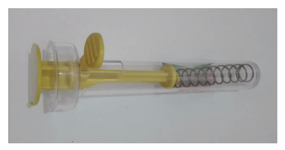
Figure 7. This is the modern which shows its mechanizim.

On the other hand, others believe that Falafel was first known to the Syrians in the middle ages, and it has spreaded in the country of Jordan, Palestine, Lebanon and Egypt through trade trips between those countries, subsequently to move to all other countries through travelers who liked its Syrian taste. Others believe that falafel is known, the first time, in Palestine, and have evolved over time to acquire its current form, and this view is supported by a number of Palestinians scholars.