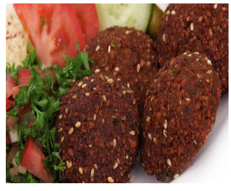
Figure 4. Egyptian Falafel Ta'amiya.