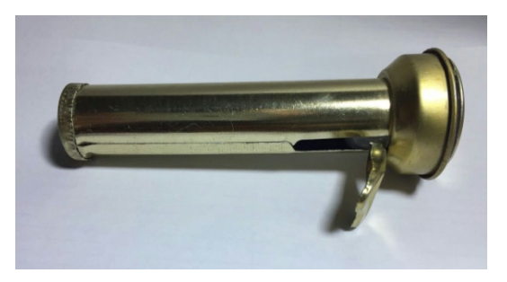
Figure 6. This is the traditional mold.