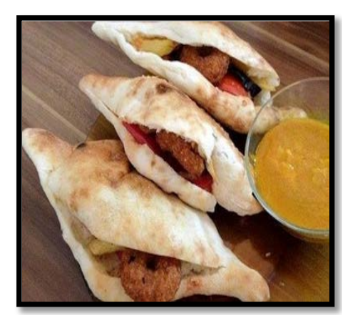
Figure 5. Iraqi Falafel Sandwich.

It is said that Egyptians are the first people who knew bean plant and have it as a human food, and they confirm that Falafel is an Egyptian invention one hundred percent. They also approve that by referring to the origin of the name, the word Falafel is an Egyptian word inherently derived from the word "Pepper", which explains the chili taste which is one of the characteristic of the Egyptian falafel. While the other name of the Falafel which is Ta'amiya is also openly endorsed it by a large number of Egyptians and say that it comes from the Egyptian dialect which derived from the Arabic word "ta'am" which means "taste". The Egyptians Chefs also confirm that the Pharaohs were the first to know Falafel or Ta'amiya, and they had stuffed it with many fillings to add more nutritional value to it, for example it was stuffed with liver or meat and sometimes eggs, to the extent that it became as a companion to the ancient Egyptian in his travels for its ability to fill the hunger [8].