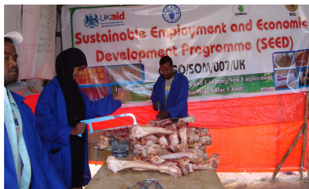
Figure 1. Bone marrow and fats harvesting from bones.

The beneficiaries were trained on how to make soap from the extracted bone marrow and other body fats from livestock ( Figure 1 ). The fats and extracted bone marrow were added into a measured quantity of water. An appropriate quantity of caustic soda was added to the mixture. The mixture was boiled for about 2 - 3 hours. Along the boiling, a colouring agent of desired soap colour was added in addition to traditional perfume extracted from the local gum tree and resin giving the soap the natural scent. The resultant mixture after boiling was stirred until it started becoming thick. At this stage it was emptied