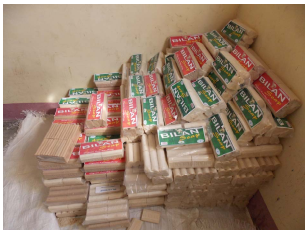
Figure 2. Finished branded soap-bilan.

The trainees were also trained on how to utilize the left-over bones that were usually dumped into municipal garbage site. The meat was trimmed from the required bones of the carcass and collected outside the operation area in a heap. These were then cut as per recommended size and then boiled to clean out any remaining meat pieces before soaking and scrubbing in soapy water. The boiled bones were thoroughly cleaned with soap and hot water to produce clean bones ready for use (Figure 3). The latter were shaped into various trinkets (ornaments) including earrings, necklaces, bottle openers, bangles, finger rings, flower vases, spoons, candle stands, key holders and a wide range of other bone jewellerys from the previously discarded bones (Figure 4). The benefici-