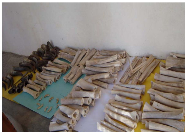
Figure 3. Sorted horns & bones for trinkets.