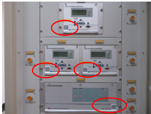
Figure 2. Two-dimensional codes pasted on substation equipments.

Ordinary smart phones can be installed intelligent inspection APP. The intelligent inspection APP support Android and iOS devices, so no extra configuration hardware equipment are needed. The mobile terminal automatically receives the inspection task from inspection management center, interacts with the server, and checks the standard. Mobile home page can view the task completed, abnormal statistics and other information. Mobile terminal supports reading two-dimensional code and bar code (see Figure 2 and Figure 3 ), automatically receives the satellite positioning signal, and sends the current location to the server in real time.