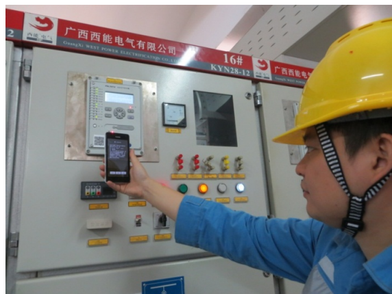
Figure 3. Reading two-dimensional code by mobile terminal.