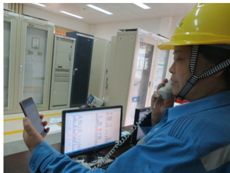
Figure 5. Inspection staff can easily view the operation and maintenance staff contact information.