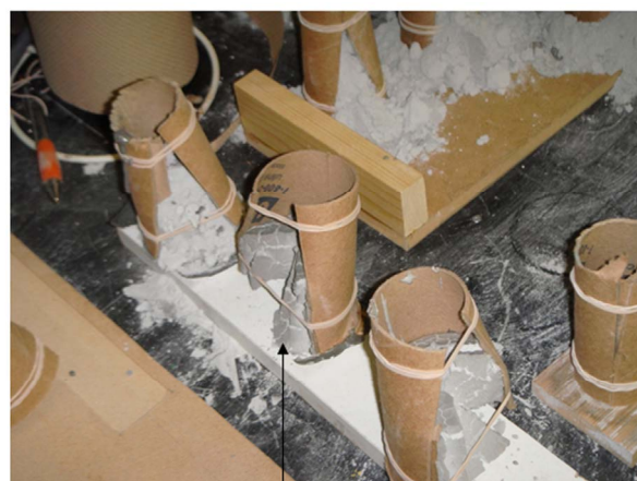
35%wt of Barium Sulphate provided the maximum degree of expansion

the system may be negligible and hence the degree of expansion would be very close to that of pure Betonamit.