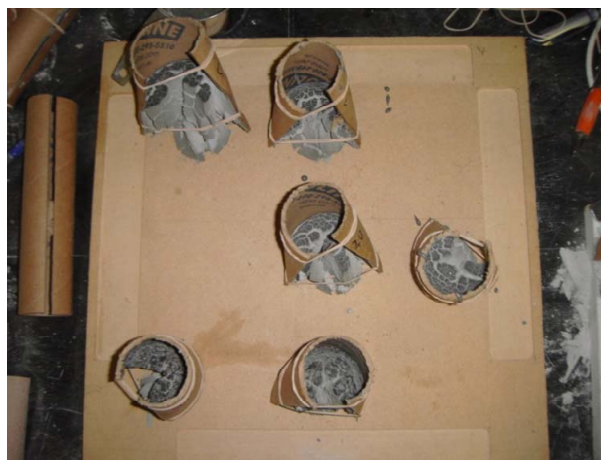
Figure 6. Slit diameters of the various BaSO 4 samples.