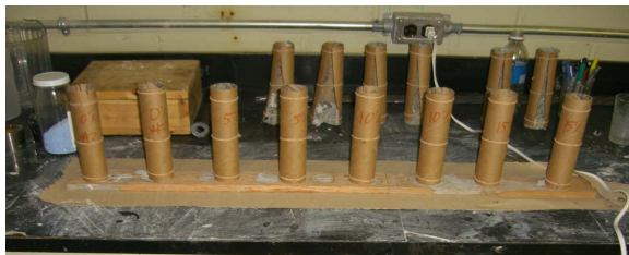
Figure 2. Samples from test #1 at t = 0.