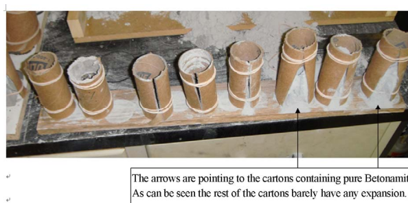
Figure 5. Slit diameters of the various CuSO 4 samples.

The same experiments as mentioned before were con-