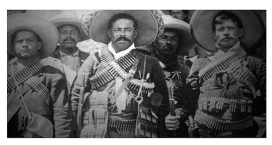
Figure 1. Pancho Villa.

for Mexican land reform in the twentieth century. During his presidency, Obregón resolved 650 claims totaling more than a half million acres, with another 400,000 benefitting from provisional allocation of another one and a half million acres (Delgado de Cantú, 1988: p. 238). Due to acrimony over the protection of the economic and property interests of citizens of the United States in Mexico, especially with respect to petroleum extraction, the Obregón administration was not recognized by the United States. Despite the assassination of retired General Pancho Villa in 1923, political order held.