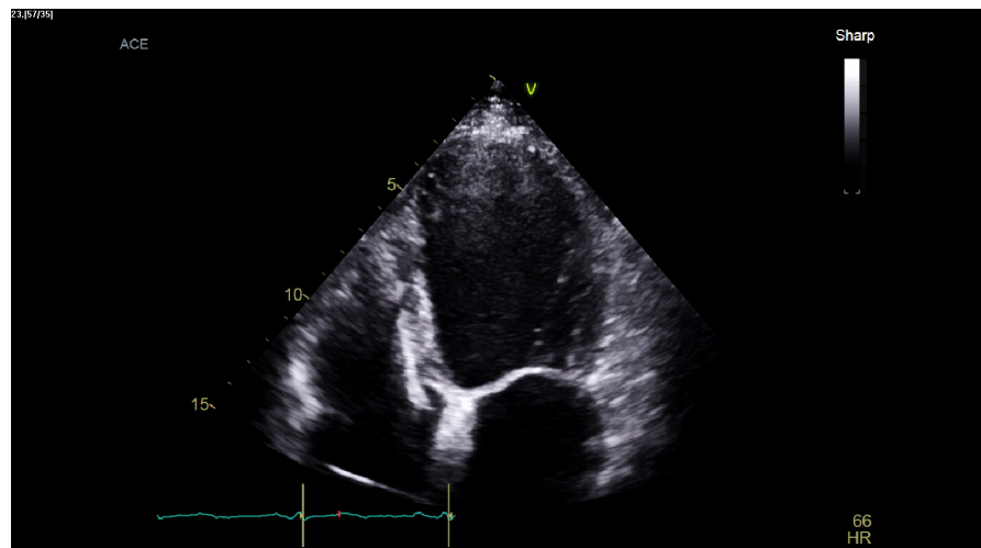
Figure 1. A four chambers view during systole.

On the fourth day of hospitalization, suddenly, the cardiac monitor showed ventricular tachycardia of about 200 beats per minute (bpm) with occasional interpolated sinus rhythm lasting five to ten beats ( Figure 3 ), the patient became