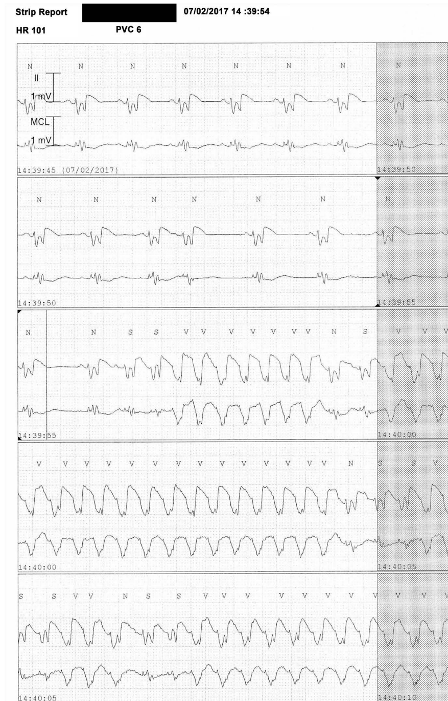
Figure 3. VT storm with sinus rhythm refractions, as observed in our patient.

Potassium chloride shouldn't be administered via IV push/bolus since uptake by the cardiomyocytes is limited by saturation of its receptors [7], and pooling of the injected potassium in the plasma can cause a transient hyperkalemia which may lead to cardiac arrest [8]. It also has an irritant and painful effect as a bolus which may cause chemical phlebitis [9].