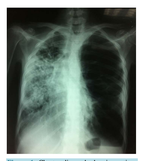
Figure 1. Chest radiograph showing reticulonodular opacities heterogeneous micro-interesting all the right hemithorax, with presence of air bubbles left with air-fluid level and distortion tracheobronchial.

A comprehensive assessment was performed including three sputum AFB smears and culture which are negative. The search for Pneumocystis jiroveci in induced sputum returned positive 2 times.