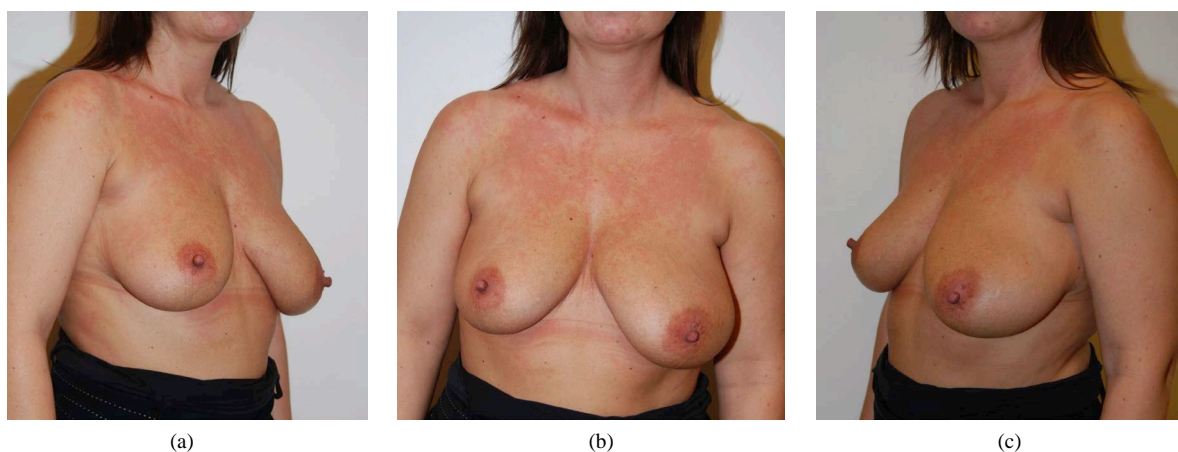
Figure 1. Preoperative photos of a 40-year women with asymmetria of the breast caused by a fibroadenoma in the upper lateral part of the left breast.

Surgery for larger and giant fibroadenomas of the breast is challenging as the resection of the tumour causes a considerable defect of the breast as well as an asymmetry to the contralateral breast. As the patients most often are young women it is of particular importance that the esthetical and functional outcome is the best possible. In the literature, several approaches to resection with or without reconstruction are described mostly as case-reports.