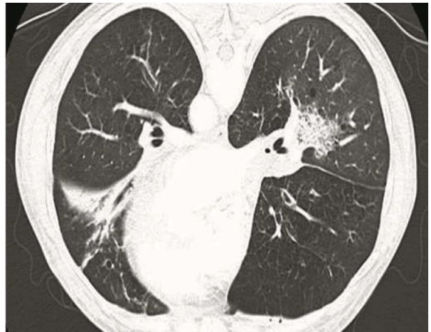
Figure 2. Chest CT showing a 1 cm irregular border nodular density in the apical posterior segment of the left upper lobe and patchy opacities in the middle lobe, lingular and lower lobes.

The patient clinically improved with peak flows back to baseline and pulse oxygen saturations in the mid to