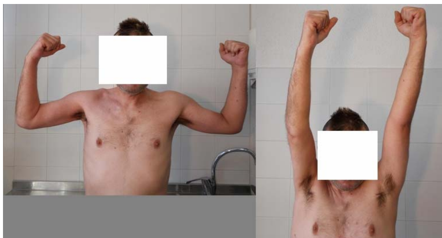
Figure 4. Full functional recovery.

quately treated with non-surgical procedures [2-7]. In certain situations such as open fractures, fractures associated to vascular and/or nerve lesions, and bilateral or multiple fractures, there is a clear indication for surgery consisting of osteosynthesis with either a plate or an intramedullary nail [7,8]. However there are a number of clinical situations where treatment selection is difficult because special attention should be paid to characteristics of the patients, as occurs when these are poorly cooperative [9,10].