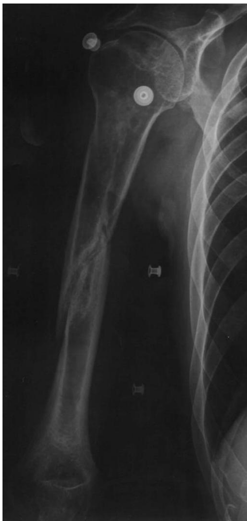
Figure 2. X-ray image 7 months after fracture with no signs of union and osteopenia/bone loss.