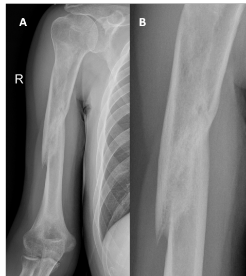
Figure 3. X-ray image after 4 months of treatment with teriparatide. Union is seen.

of pain and complete functional recovery which allowed the patient to return to his usual activities ( Figure 4 ). Results of laboratory tests performed during treatment were normal, showing no complication attributable to the drug. No side effects attributable to the drug were observed during treatment and subsequent laboratory tests continued to be normal.