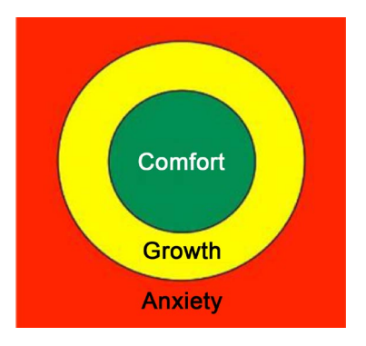
Figure 2. The growth zone diagram.

In this paper, we present an illustrative phenomenological study of Hani, a