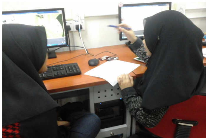
Figure 3. Students work collaboratively upon completing the task.