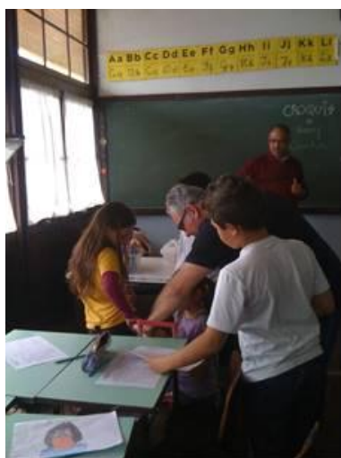
Figure 3. Teachers and students working together.

Two outings were visits to universities. The first was in a private one—Universidade Positivo—where they assisted a presentation of the young girls belonging to the Rhythmic Gymnastics Club. They, as well, did exercise gymnastics monitored by the teachers and coaches: running, games, jumps, rollers. Some of them were afraid at the beginning but the will to be part of the sport activity changed their minds and motivated them to