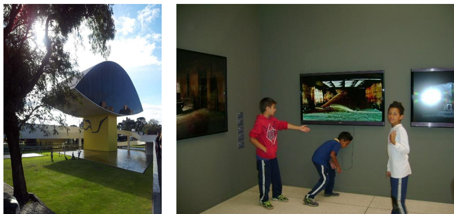
Figure 4. The eye museum of Curitiba inside and outside.