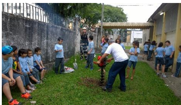
Figure 12. Planting at the box and digging the grave for planting a tree.

To contextualize the theoretical concepts, we used pedagogical tools shifting the emphasis from professors to student’s activities with school junior students. We joined student’s motivation and interest in a subject with the request of active learning. We believe the use of case studies were beneficial, enjoyable and challenging not only to the professors and the post-graduate students but also to the people who have worked in the experiences. The general comments heard from the schools people were that the structure of the course itself offered a wider range of background skills and it was easier to introduce confidence in their abilities to develop new dimensions to the teaching and learning activities. We evaluated whether our courses were meeting the objectives we set for them in terms of increasing student motivation, theoretical contents essentials to ensure good teaching. We did this by questionnaires and rapports (see Table 1 ).