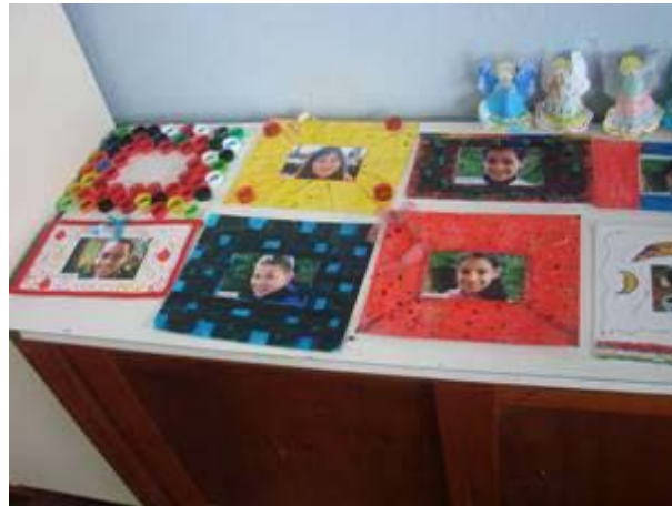
Figure 9. Students' pictures and frames.

The urban agriculture activities continued at the third school, Papa João XXIII. We organized a garden in appropriate boxes for small spaces and the students planted spices, such as marjoram, basil, oregano, mint, rosemary, lemon thyme, mint, among others. They had a great pleasure to mix the different kind of earth and the fertilizers (see Figure 11 ).