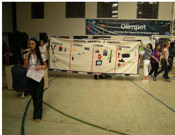
Figure 1. Final presentation of the environmental project.

Students from 9 to 13 years old changed their damaging view of studying all day and they felt rewarded with the opportunities to express their personal, feelings, reflections in different situations (see Figure 2 ). We worked hard to planning, developing, managing, using, and evaluating our practices. The needs and requirements to organize outings, class activities grounded in an educational, cultural and environmental interdisciplinary expertise and knowledge constitution helped us, university students and professors, to select and to assemble elements to form concepts properly within the school domain.