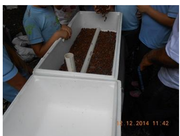
Figure 11. Children working in the planting stages.