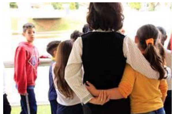
Figure 2. Teachers and students expressing their feelings in state of observation.