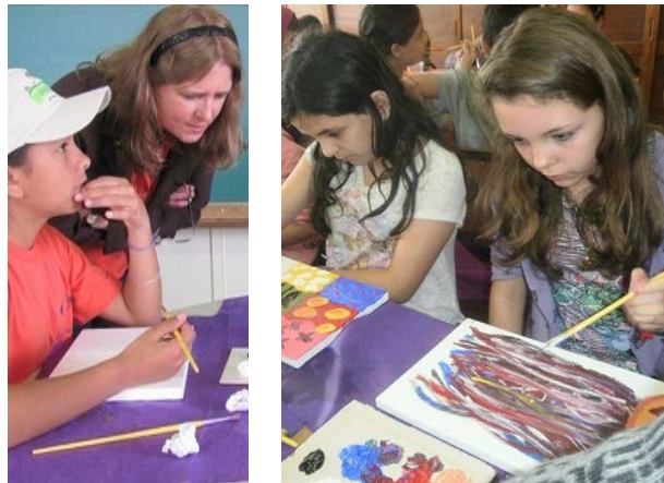
Figure 6. Activities at the Curitiba' Botanical Garden.

make efforts to get a performance. Returning to school, in the bus, the students expressed their pleasure to play in such a nice place (see Figure 7 ).