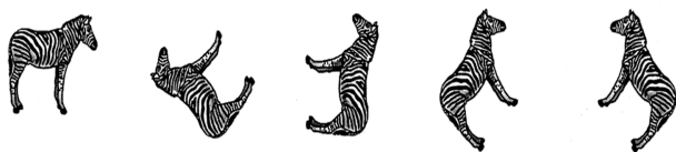
Figure 1. Example item of the mental rotation test.

The Picture Mental Rotations Test is a paper pencil mental rotation test and we included one set of animal pictures as stimuli. Each row is comprised of one target item on the left side and four sample items on the right side. Two of the four items on the right side were correct, meaning identical but picture plane rotated versions of the target item on the left side ( 45^\circ , 90^\circ , 135^\circ , or 225^\circ rotated compared to target item). The other two items were incorrect, which means that they were mirror images of the target item (see Figure 1 ). The children's task was to cross out the two correct items on the right side within a time limit of three minutes for the 16 rows. There were two