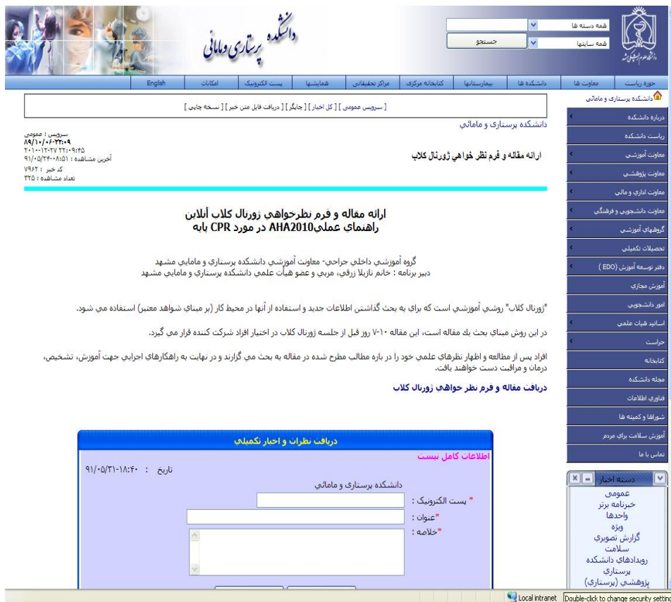
Figure 1. The designed virtual spaces for electronic journal club: Early explanations and registration.

It was predictable that participants were working at different health care professions, so, the selected paper was based on general critical skills, consequently, inter professional relationship could be made by this virtual space, at the same time they could develop their reading professional reading during this process which could be considered as a continuing education at the same time in a friendly use approach. Obviously, improving professional knowledge and competence would be influential on quality of care, the goal of medical education.