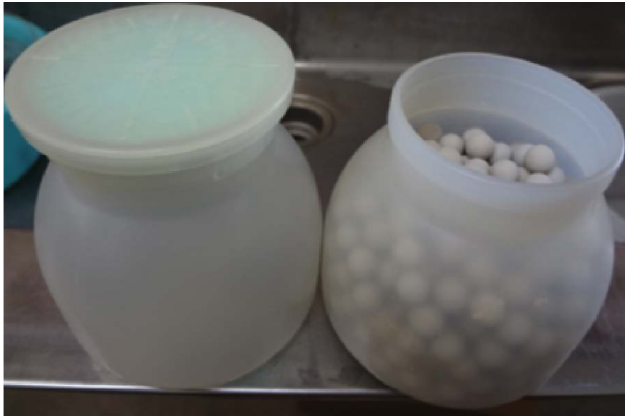
Figure 1. Ceramic beads and bottles used in this experiment.

ceramic beads with 750 ml nutrient solution. Nutrient solution was composed of CMC-Na 50 g, potato powder 20 g, glucose 20 g, yeast extract 2 g, peptone 2 g, \text{MgSO}_4 \cdot 7\text{H}_2\text{O} 0.5 g, \text{KH}_2\text{PO}_4 0.5 g and 1000 ml distilled water. Pholiota microspora was cultivated in a larger bottle filled with 700 g substrate or 490 g of ceramic beads with 210 ml nutrient solution. All substrates were added in distilled water in order to adjust the moisture content to 30%.