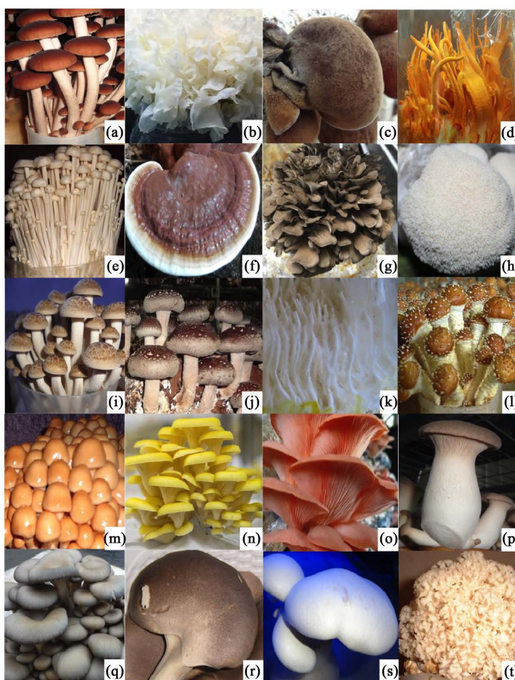
Figure 2. Fruit bodies of the ceramic beads substrate cultivation. (a) Agrocybe cylindrical ; (b) Auricularia fuciformis ; (c) Auricularia polytricha ; (d) Cordyceps militaris ; (e) Flammulina velutipes ; (f) Ganoderma lucidum ; (g) Glifola frondosa ; (h) Hericium erinaceus ; (i) Hypsizygus marmoreus ; (j) Lentinula edodes ; (k) Ophiocordyceps sinensis ; (l) Pholiota adiposa ; (m) Pholiota microspore ; (n) Pleurotus cornucopia ; (o) Pleurotus diamor ; (p) Pleurotus eryngii ; (q) Pleurotus ostreatus ; (r) Pleurotuscystidiosus subsp. abalones ; (s) Pleurotuseringi var. tuolienensis ; (t) Sparassis crispa .

All the tested species of the edible mushrooms produced fruit bodies on the ceramic bead substrates, shown in Figure 2 . We found that 11 species responded better with the new substrate compared to the control substrate. Figure 3 illustrates the fruit bodies weight of the 20 species performing under the ceramic