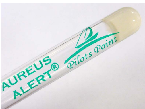
Figure 4. aureusAlert S. aureus positive—clot.