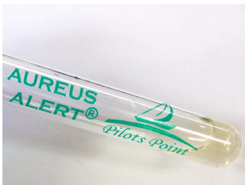
Figure 3. aureusAlert S. aureus negative—liquid.