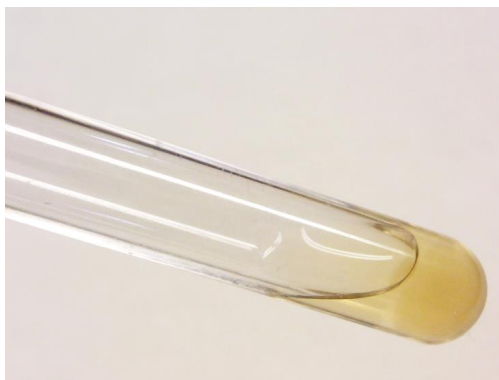
Figure 1. EPI-M ® MRSA negative—straw-colored.

Control S. aureus standards ATCC 25923 (MSSA) and ATCC 43300 (MRSA) plus 5 MSSA and 5 MRSA isolates from patients were tested. MSSA and MRSA isolates were diluted from 7 log 10 to 1 log 10 and incubated at 35°C and 23°C. Based on quantitative analysis of pure cultures, the Defined Substrate Utilization ® (DSU ® ) tools were able to detect as low as 20 CFU (18 hours of incubation) with both MSSA and MRSA ( Table 1 , Table 2 ). Table 3(a) and Table 3(b) present results of the nasal screening of normal subject volunteers in aureusAlert ® . Table 4(a) and Table 4(b) present the nasal screening results in EPI-M ® . For both the detection of S. aureus and MRSA there was no difference between the DSU ® tools and conventional methods. aureusAlert ® and EPI-M ® showed a specificity of 100%.