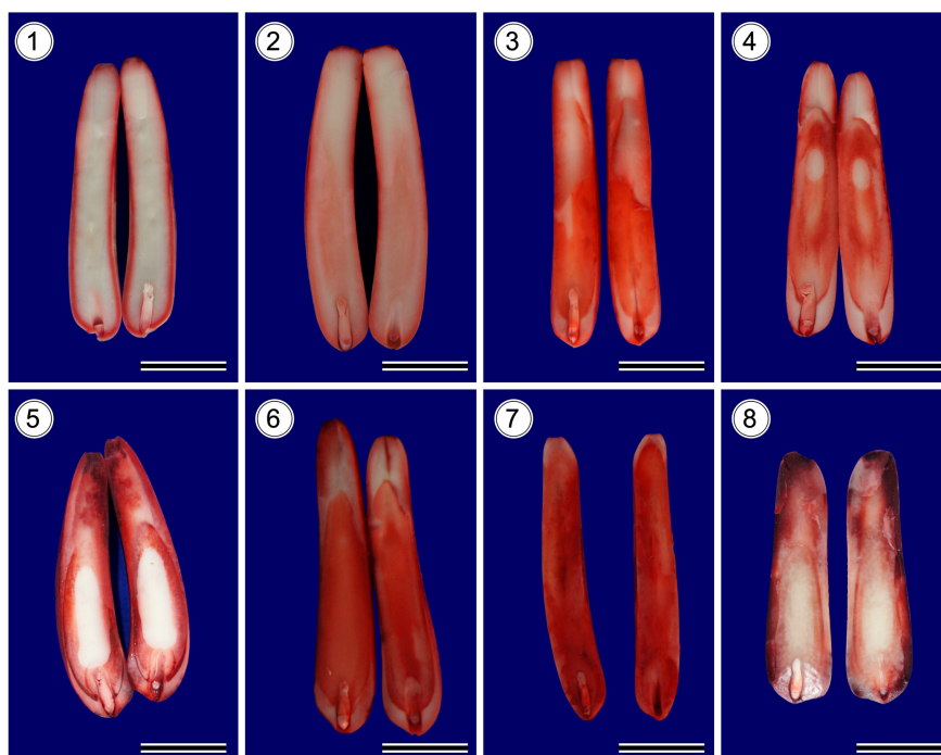
Figure 1. Classes 1 to 8 for the determination of viability of P. multijuga seed by tetrazolium test. The bars represent 20 mm.

Class 5 (Viable): cotyledon and embryonic axis with pink or red staining, with light or white stains in the center of cotyledons. Tissues with normal and firm aspect.