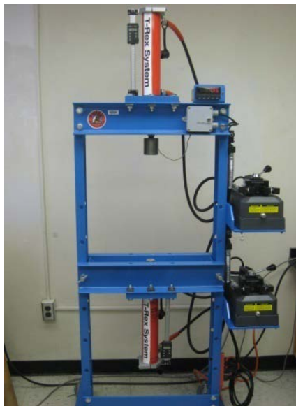
Figure 1. Compression test stand (Cooper Instruments and Systems; maximum vertical load: 1000 kg).

The stand is equipped with a digital display of displacement and vertical force. The compression force (vertical) was measured with a load cell on the rod end of the cylinder while the displacement was measured with a