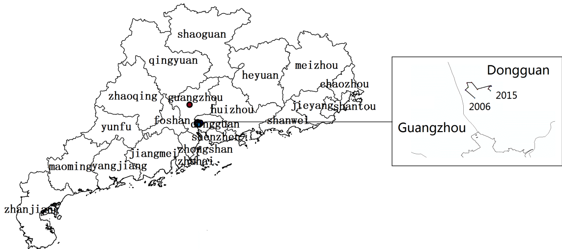
Figure 1. The change track of overall gravity center of manufacturing industry in Guangdong province in 2006-2015.