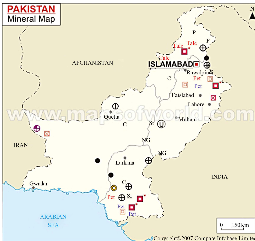
Figure 5. Map of distribution of major minerals in Pakistan (the map shows location of Pet: Petroleum, U: Uranium, NG: Natural Gas, Sr.: Strontium and Talc-Mineral-composed of hydrate and magnesium silicate) source Compare Info base limited, 2007.