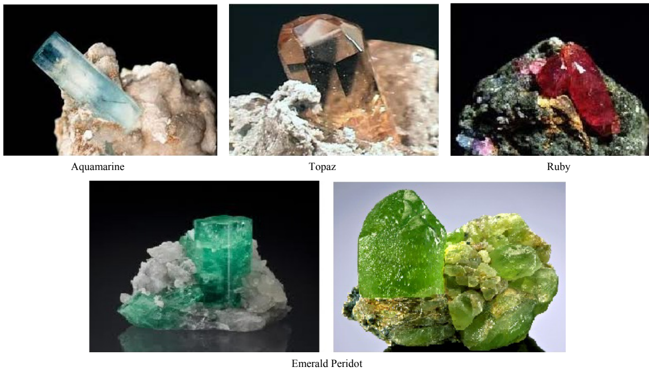
Figure 3. Important gemstones in Pakistan.