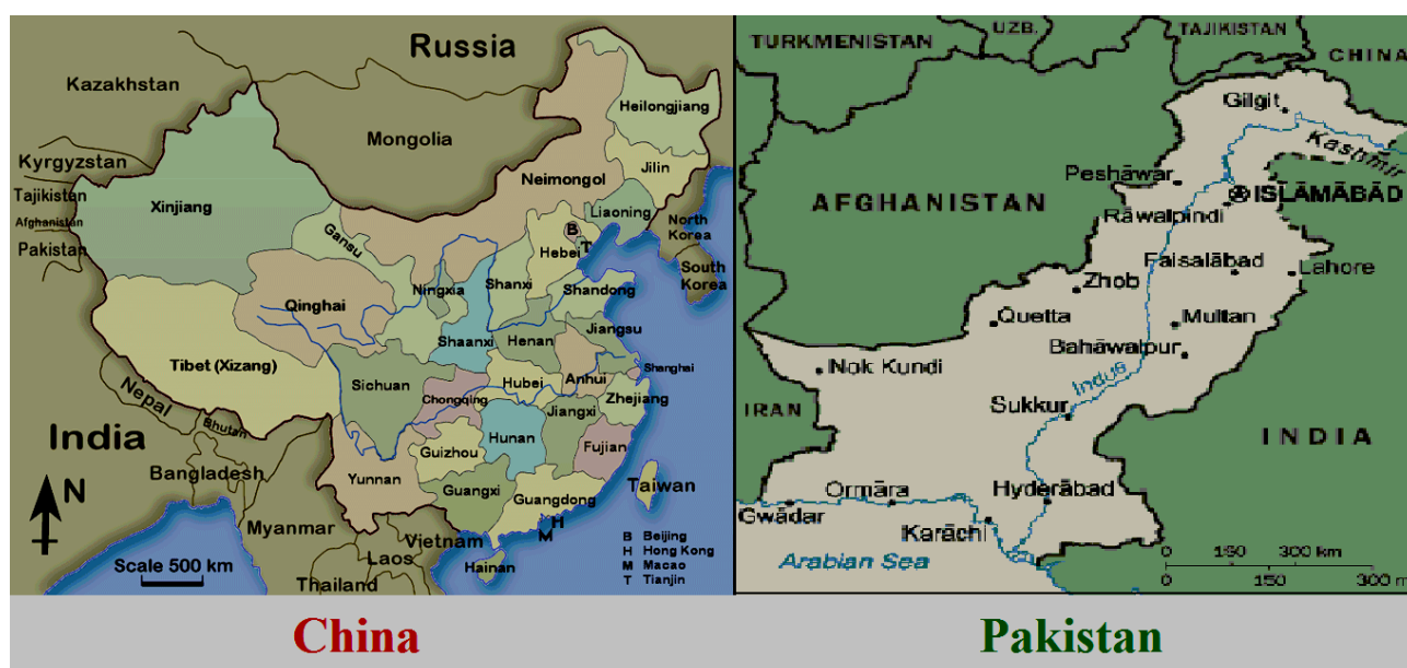
Figure 1. Political map of Pakistan and China and international location.

Pakistan can be assumed to be a heaven for mineral resources. Several minerals deposit including coal, copper, gold, chromite, salt, bauxite and others (Figures 2 to 5 and Table 1). A variety of precious and semi-precious minerals are also mined, these include peridot, aquamarine, topaz, ruby, emerald, rare-earth minerals bastnaesite and xenotime, sphene, tourmaline (Figures 2-5), and many varieties and types of quartz [4] The mineral industry has grown since independence from exploring only 5 minerals to the current 52. Since independence, majority of minerals mined were discovered by the Geological Survey of Pakistan (GSP) [5]. Among the ap-