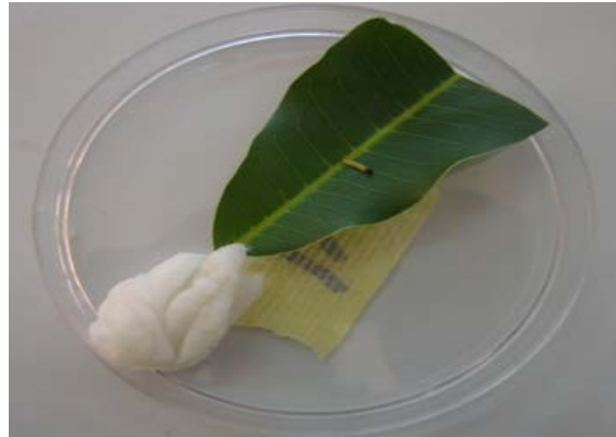
Picture 2. Larva L1 isolated in a petri dish. Scale: \leftrightarrow 1 cm.