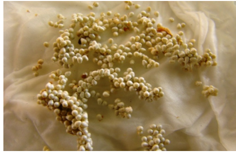
Picture 1. Eggs from an ootheca separated for the count. Scale: \leftrightarrow 1 mm.

under ambient conditions in the laboratory, each L1 larvae was placed individually, on its hatching day, in a petri dish containing a portion of leaflet kept fresh by a piece of cotton soaked in water and coiled at the tip of the leaf stalk ( Picture 2 ). Every day, the larva was removed from the tube in order to check (under a binocular lens) whether it had carried out its first moulting. Moulting was verified by finding, near the larva, the old cephalic capsule that is shed during moulting. The larva was observed in the same way during the following stages until the formation of the pupa. This experiment was repeated 100 times (that is, four replications of 25 larvae). When the larvae passed into the immobile pupae stage, the latter were recovered and placed in the breeding cages containing sterilized sand in order to determine the pupal development time until the emergence of the adults.