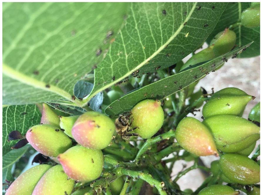
Figure 2. Forager honeybee collecting honeydew from pistachio tree infested by Agonoscena pistaciae .