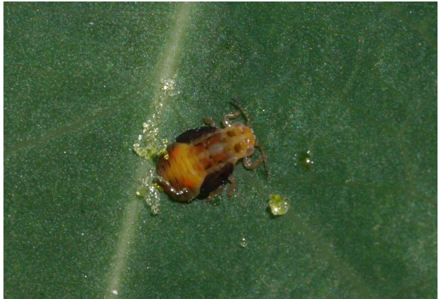
Figure 1. Agonoscena pistaciae nymph feeding on leaf.