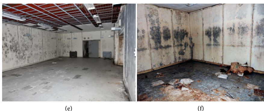
Figure 10. Admiral bunker (37)—(a) armored sliding door, on the right electrical, heating element; (b) internal room, suspended ceiling with white coverage panels in place; (c) modern galvanized aerator; (d) internal room, metallic suspension frame in place and white panels fallen on the floor; (e) internal room with metallic suspension frame and no white coverage panels; (f) internal room, white painted walls with marked traces of moisture.

place, sometime gray re-painted, sometime rusted but preserving their original blue painting.