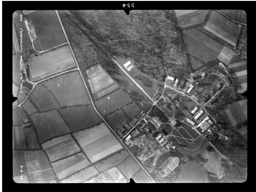
Figure 1. Domaine of Pignerolle: general view of the BDU: on the lower right, the castle and the BDU barracks and bunkers. C1522.0501_1948_CDP2928_0380, n°380, 1/4866, Argentique, 02/03/1948.