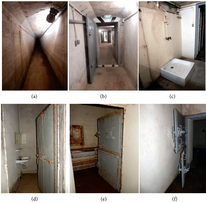
Figure 9. Admiral bunker (37)—(a) tunnel towards the castle; (b) bunker entrance, original light armored door 19P7; (c) shower system; (d) toilet in good preservation state; (e) original heavy armored door 434PO1 of a close combat defence room (2), on the wall defence original plate 483P2; (f) original armored port 434PO1.