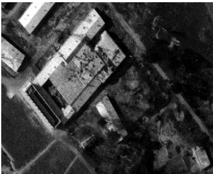
Figure 8. Admiral bunker (37)—on the left barracks (30), (33), the hanging barracks (34), (36), on the right barracks (38) (39) and bunker (40).

A recent shower system was in place at the entrance, complete with its white rectangular base, hot and cold water mixing taps, but no splash guard. Recent toilets were in good preservation state. All the original armored doors were in