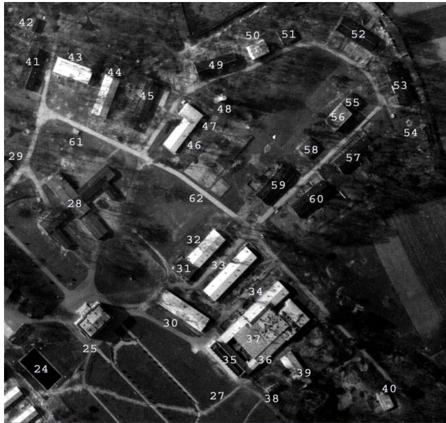
Figure 3. BDU organization—North part: (24) pool; (25) castle; (27) internal path; (28) administrative building; (29) - (30) barrack; (31) bunker; (32) (33) barrack; (34) barrack leaning to the Admiral bunker, (35) orangery, (36) barrack leaning to the Admiral bunker, (37) Admiral bunker, (38) (39) barrack; (40) bunker, (41) - (46) barrack; (47) bunker; (48) water tower; (49) barrack; (50) bunker; (51) - (53) barrack; (54) possible Flak position; (55) barrack leaning to the bunker (56); (56) bunker; (57) - (61) barrack, (62) internal path.