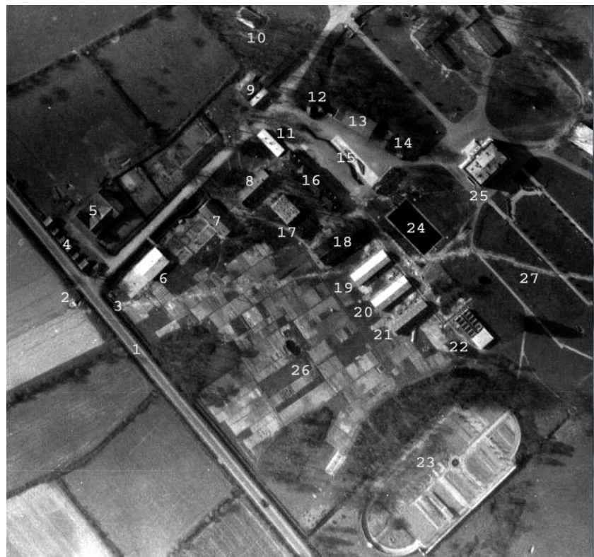
Figure 2. BDU organization—South part: (1) route de Beaufort; (2) external guard post; (3) internal guard post; (4) six small barracks; (5) two corps barrack; (6) - (8) barrack; (9) three corps barrack; (10) bunker; (11) barrack; (12) pigeon house; (13) - (15) barrack; 16 castle dependence; (17) bunker; (18) - (22) barrack; (23) vegetable garden; (24) pool; (25) castle; (26) cultivated area; (27) internal path.