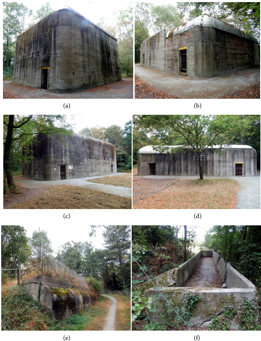
Figure 6. BDU site surviving components—(a) bunker (47); (b) bunker (50); (c) bunker (56); (d) bunker (31); (e) bunker (40); (f) concrete cistern.

its heating and aeration system disappeared. Only aeration conduit portions were in place on the walls. Their external concrete structures were in good preservation state. The coverage of bunker (31) was further covered by a recent metal sheet. Bunker (50) was accessible during the first visit. Its interior was in good preservation state with armoured doors still in place. All the original furniture disappeared and only aeration conduit portions were in place on the walls. Its external concrete structure was in good preservation state and the coverage was further covered by a recent metal sheet.