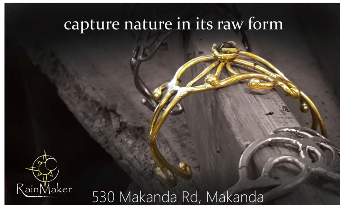
Figure 5. Promotional campaign for Rainmaker Art Grotto (designed by Peyton Schnurr).

concern for the environment. For instance, despite their proximity to the North Sea petroleum fields, Orkney is leading the way for sustainable renewable energy (McKie, 2019). Using biodegradable materials for packaging, sustainable harvesting, upcycling, etc., these environmentally conscious practices can all be a part of the story of traditional arts and crafts in these communities.