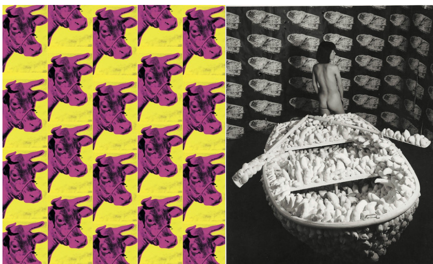
Figure 3. Cow C , 1966, Leo Castelli Gallery, Andy Warhol ; One Thousand Boats , 1963, Yayoi Kusama.

Kusama said. “Dot is a symbol of life.” Dots like cells, eggs and sperms, are the smallest units of organisms. These units pile up tissues, organs, and living bodies.