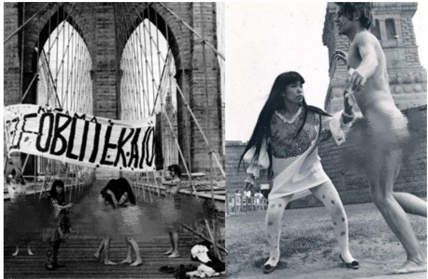
Figure 4. Kusama's happening at the Statue of Liberty, Liberty Island, New York, 1968

The textures composed by these dots, stretching and crossing, represent the flow of life. Since the sexual organs are tools for reproduction, Kusama uses polka dots pattern on Phallic works, and give them the meaning of breeding, living and regeneration ( Figure 4 ).