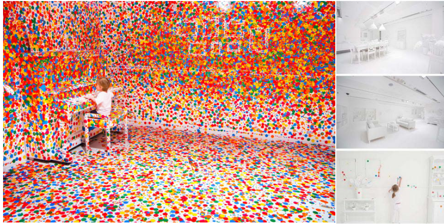
Figure 7. Give Me Love, 2015.

her infinite pain, she takes this pain to create art, and pursue art for her entire life. It could be said, Yayoi Kusama creates art, and art saved her.