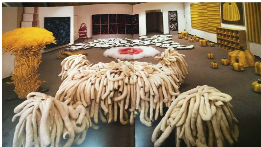
Figure 5. Installation view, 1984, Fuji Television Gallery.