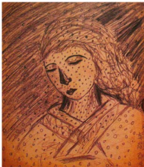
Figure 2. Untitled , 1939, pencil drawing, 35 cm × 25 cm Japan.

From then on, switching to sculpture and performance as her primary mediums, Kusama became a fixture of the New York avant-garde, associated with the pop art movement. Once, Andy Warhol came to Kusama's opening, saw the