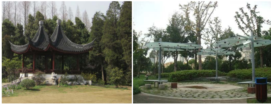
Figure 5. Translucent material landscape pavilion and opaque material landscape pavilion.