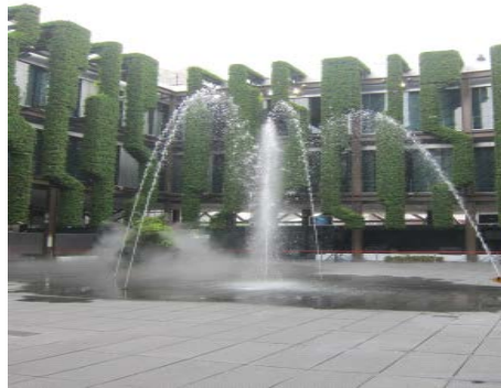
Figure 2. Fountain.