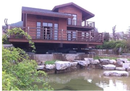
Figure 3. Running water.

hot space to cool down, effectively increase the comfort of the human body. With the evaporation of water, the influence of water on the air temperature in the city is accompanied with the humidity effect. Recent studies revealed that outdoor thermal environment factors, including air temperature, wind speed, relative humidity and solar radiation, affect assessment of thermal comfort, e.g., thermal perception and satisfaction [13]. However, the differences in the comfort of people in different spatial climates are different (see Table 1 ). The humidity level influence how temperatures are felt. High humidity reduces the comfortable maximum temperature; low humidity allows a tolerance for higher temperature. At the lower limit of the comfort level humidity has little influence for individual perception and satisfaction which could be applied in material selection.