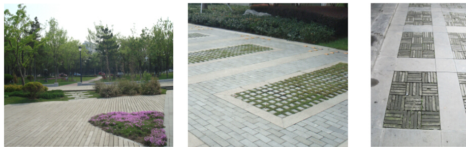
Figure 6. Rigid pavement combined planting, Grass brick inlay and different combinations of pavement.

can effectively improve the regional climate.