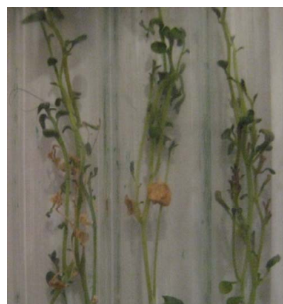
Figure 2. In vitro evaluation of drop method—View necrosis and leaf chlorosis.