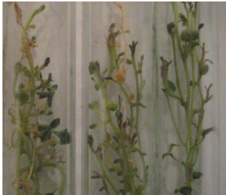
Figure 3. In vitro evaluation of direct method—View necrosis and leaf chlorosis.

Dita Rodriguez et al. reported that the susceptible genotype Desiree, genotype Delta is resistant. These findings are consistent with our results [20].