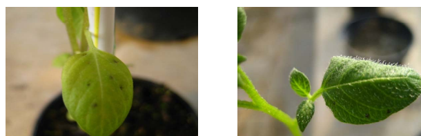
Figure 1. Greenhouse evaluation—View chlorotic and necrotic spots caused by pathogenic A. solani .