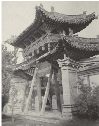
Figure 6. Le Shan Fang (the original building has been destroyed).

In 1240 during Southern Song Dynasty (1127-1279), mass famine claimed the lives of people across Zhejiang province. The government called on local wealthy families to deliver food for starvation relief; however, most of these families did not respond at all. The Li family in Chou Men village, although not that wealthy, opened the granary to distribute food to famine victims in seven counties. As a result, a memorial archway called ‘ Le Shan Fang (Benevolence Building)’ was built by the government for particular commendation.