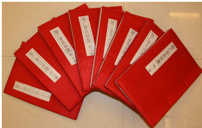
Figure 2. Li's Genealogy Books (1666-1994).