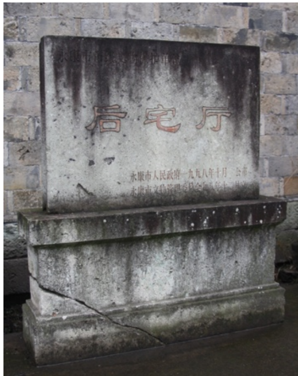
Figure 5. The Nameplate of Cultural Relics Protection.