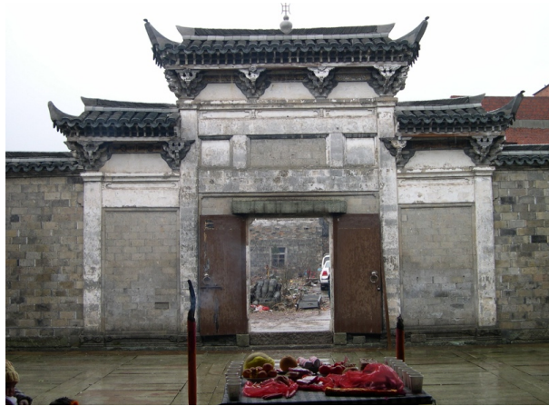
Figure 4. Li's Ancestral House (1533).

Dynasty (1368-1644). The house is now listed as protected cultural relics.