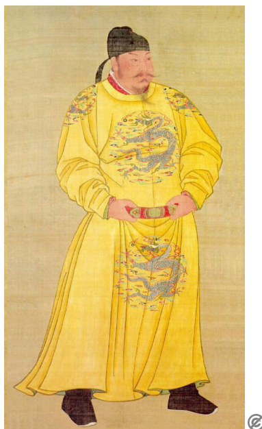
Figure 3. Li Shimin (28 January 598 - 10 July 649).