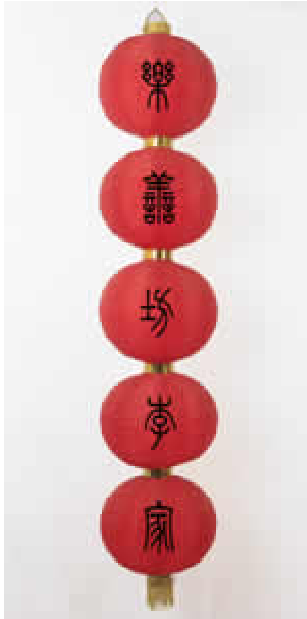
Figure 8. Le Shan Fang Lantern.

The ancestor Li Duanlǚ (October 11, 1202 - December 3, 1267) received a commendation in recognition of his selfless deed during the famine. Even after the Li family moved from Chou Men to Hou Ren village, Yongkang County, the 'Le Shan Fang' Li family was still written on the Red Lantern hanging during the Spring Festival.