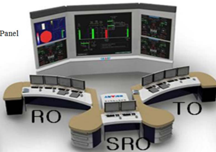
Main Monitoring & Control Workstation